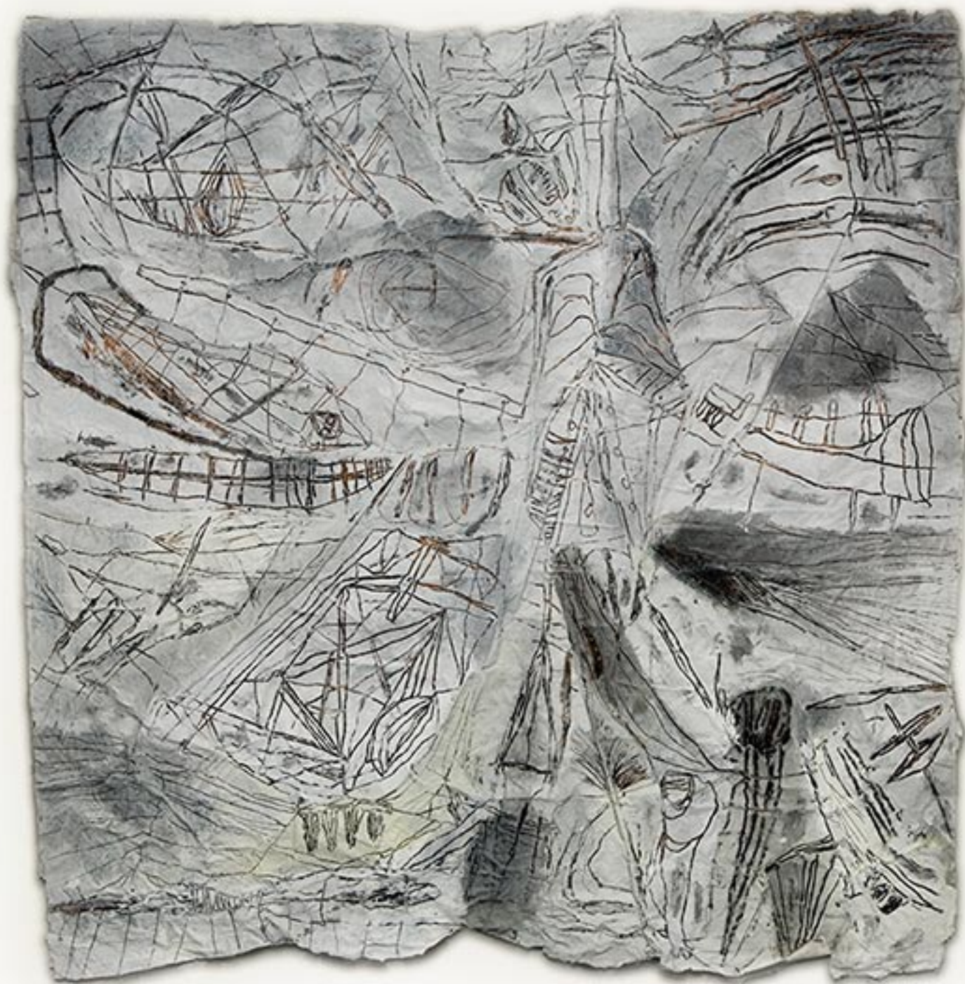
Hand made paper, Gouache, Acrylic - 100X100 cm