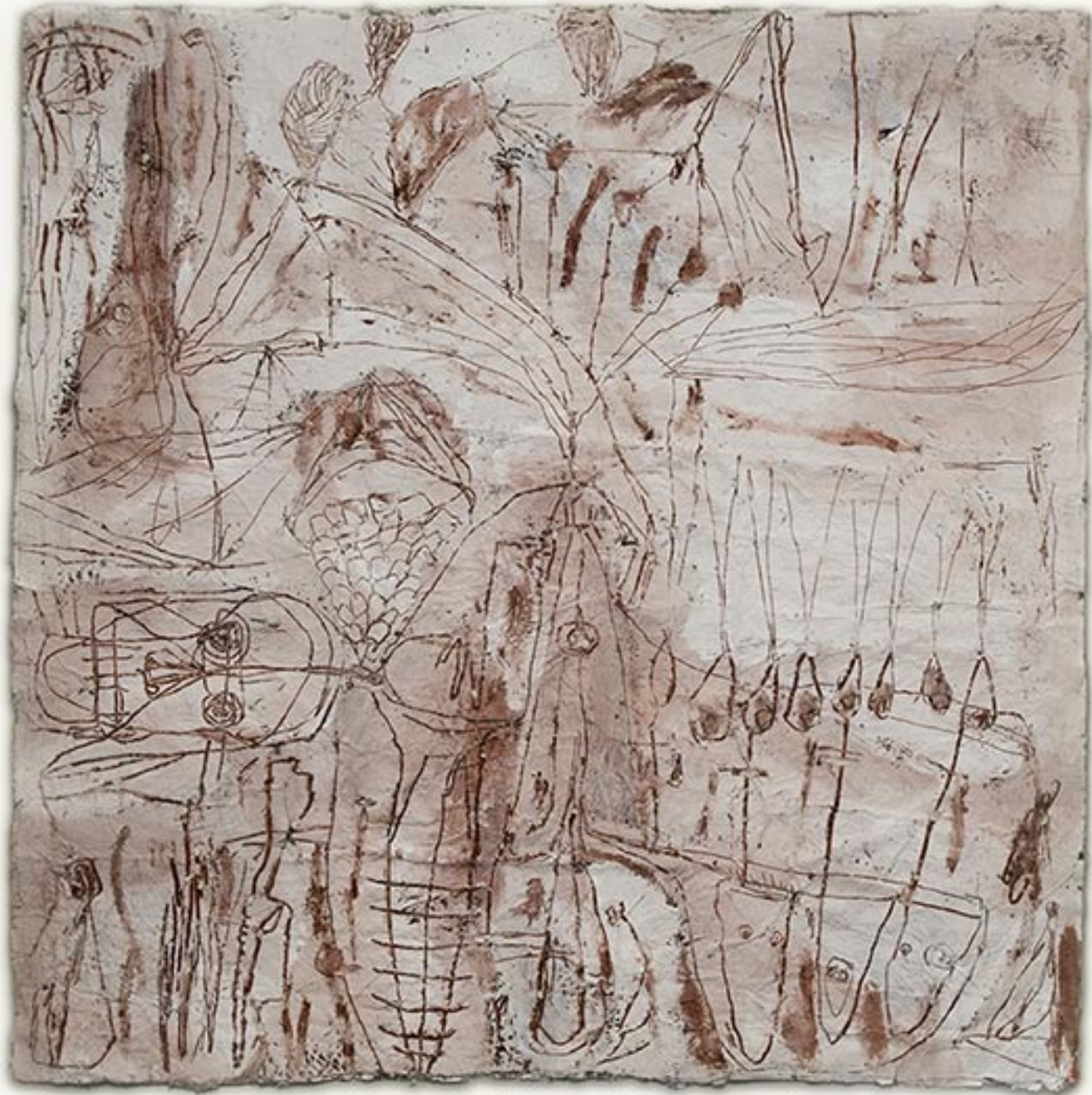
Hand made paper, Gouache, Acrylic - 100X100 cm