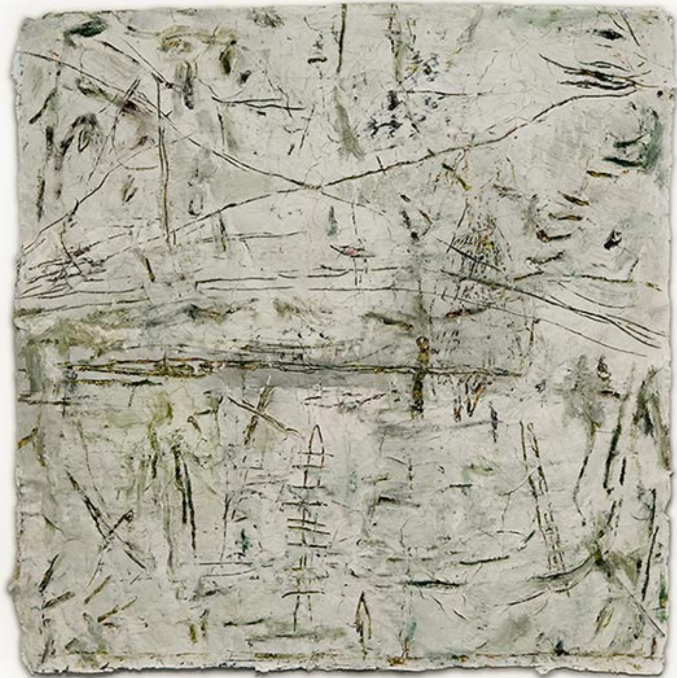
Hand made paper, Gouache, Acrylic - 75X75 cm