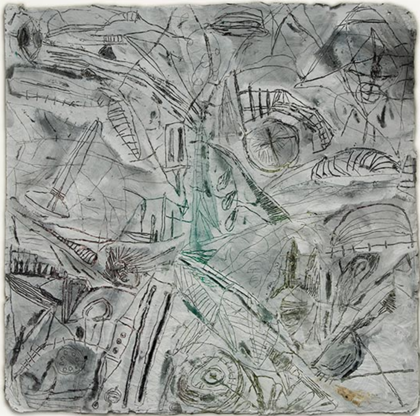
Hand made paper, Gouache, Acrylic - 100X100 cm