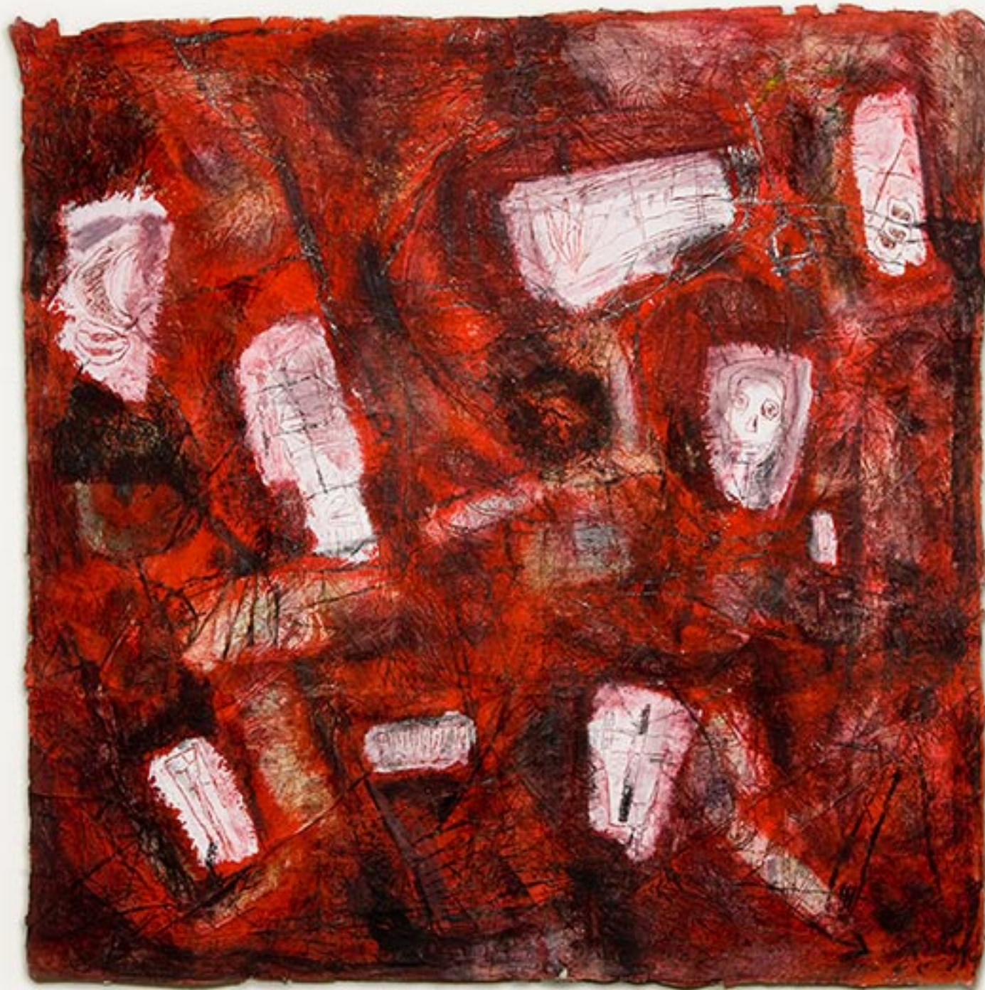
Hand made paper, Graphite, Gouache, Acrylic - 100X100 cm