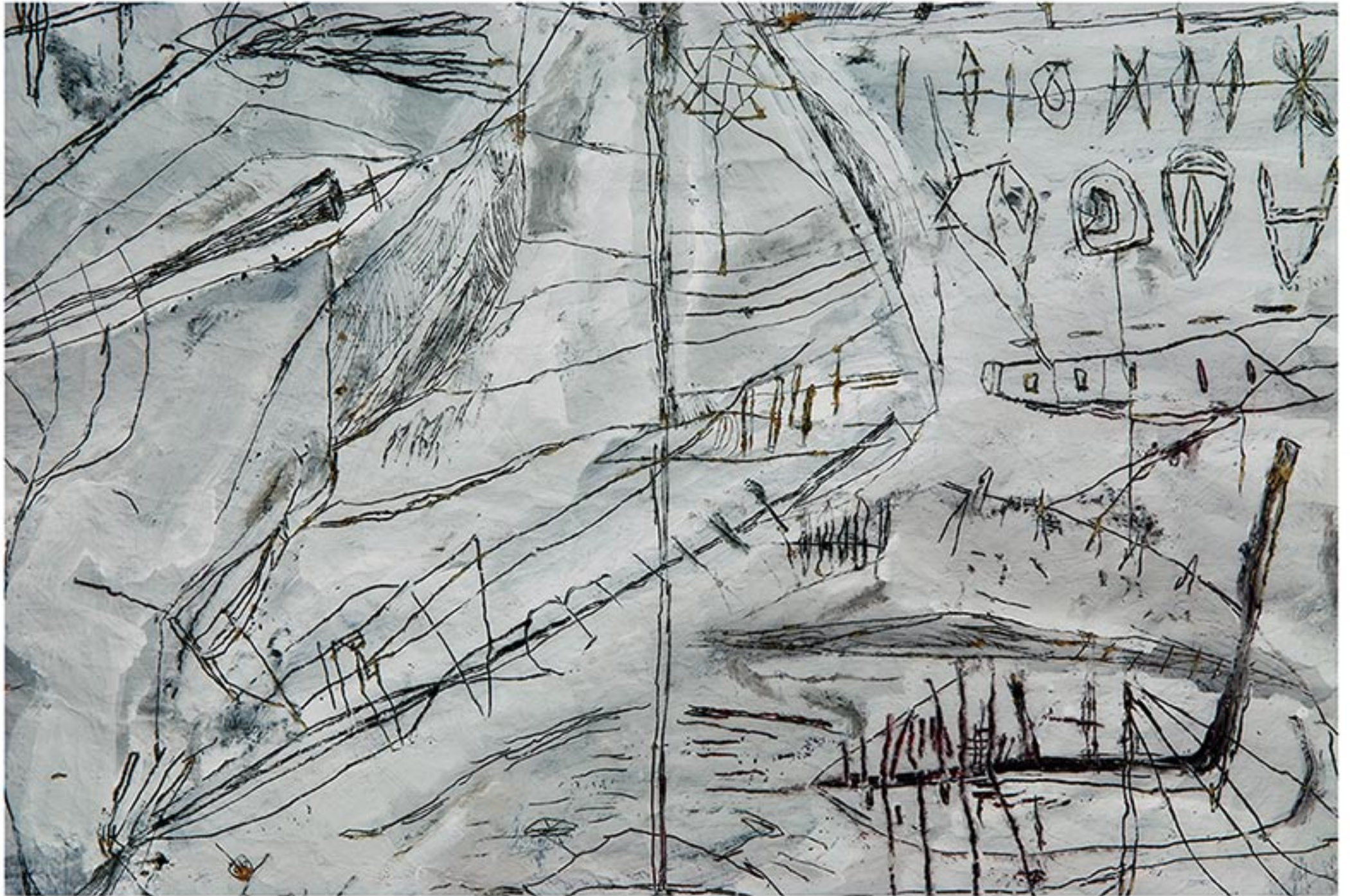
Hand made paper, Gouache, Acrylic - 100X100 cm (detail)