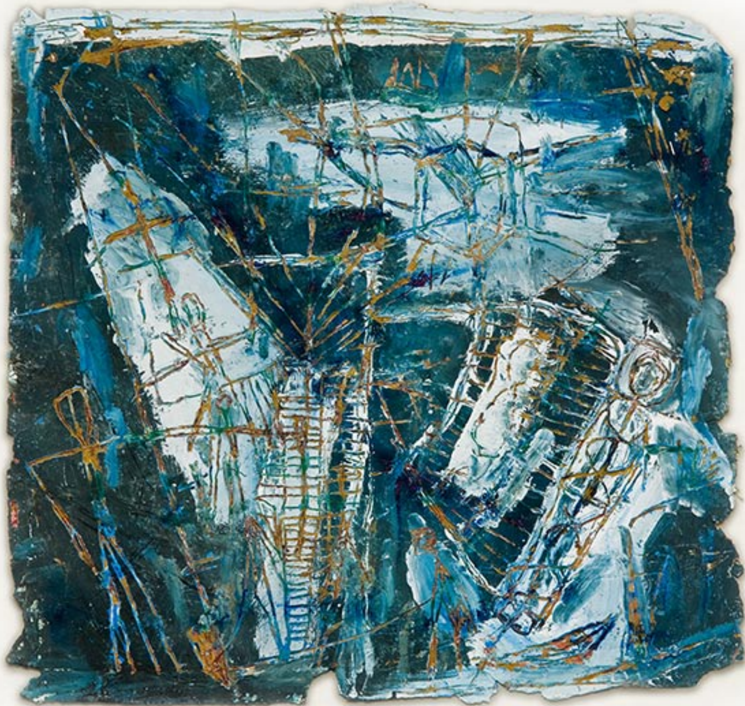
Hand made paper, Gouache, Acrylic - 50X50 cm