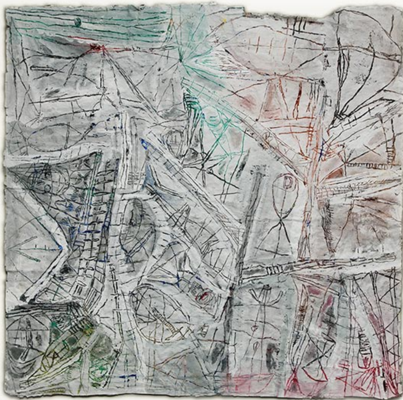
Hand made paper, Gouache, Acrylic - 100X100 cm